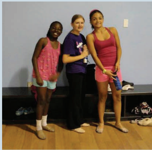
What a great group of girls! Thanks for taking a break to strike a pose.

These are great tools to help your child practice their routine outside of class.